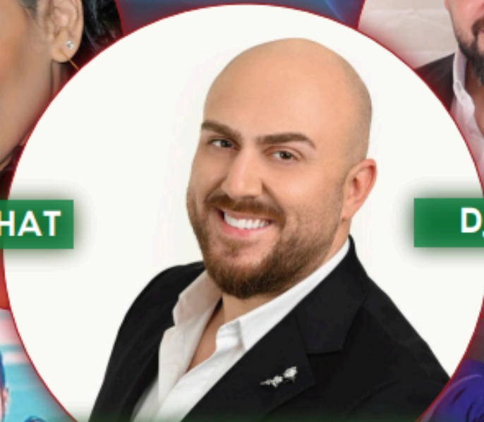
FEATURING ENTERTAINER RAMI BADR