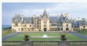
THE BILTMORE & WINERY Wednesday, 9:30am–7:00pm