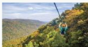
THE GORGE ZIP-LINING Wednesday, 9:30am–5:15pm