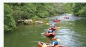
GREEN RIVER KAYAKING Wednesday, 9:45am–5:15pm