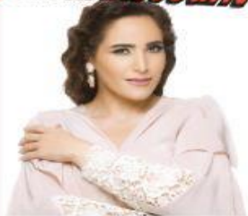
ABEER NEHME Lebanese Angelic Voice Thursday Concert

Pre-Registration Discount ends on June 5