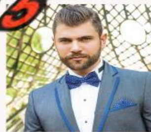
MICHEL AZZI Lebanese Superstar Saturday Grand Banquet