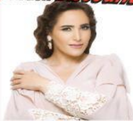
ABEER NEHME Lebanese Angelic Voice Thursday Concert