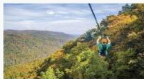
THE GORGE ZIP-LINING Wednesday, 9:30am–5:15pm