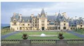
THE BILTMORE & WINERY Wednesday, 9:30am–7:00pm