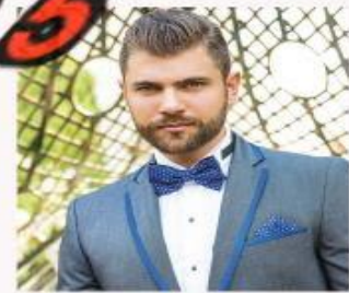
MICHEL AZZI Lebanese Superstar Saturday Grand Banquet