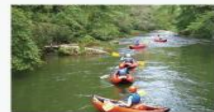
GREEN RIVER KAYAKING Wednesday, 9:45am–5:15pm